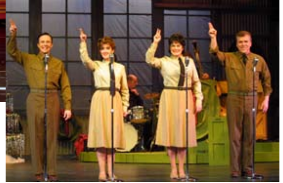
G.I. Holiday Jukebox