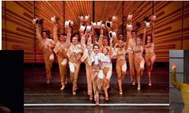
A Chorus Line